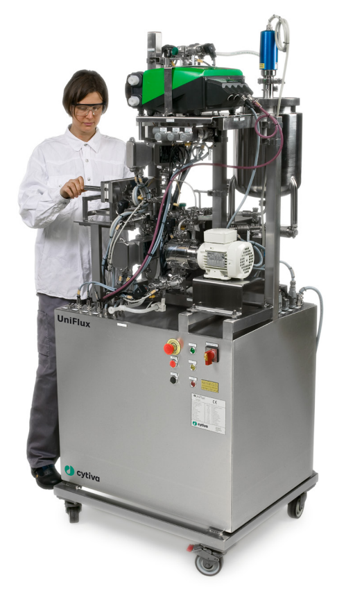
Fig 1. UniFlux 10 system configured for cassettes and with 10 L tank.

UNICORN software has undergone an independent audit and is designed as a validatable control package for use in a FDA 21 CFR part 11 and GMP compliant manner. The electronic signature and record system uses a dual password confirmation, document locking scheme, and traceable audit log. For integration purposes, UNICORN software communicates with control systems via object linking and embedding (OLE) for open platform communication (OPC).