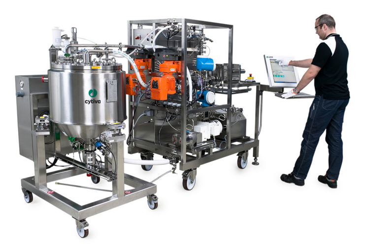
Fig 3. Integrated UniFlux 30 system and 100 L tank allow fully automated TFF via UNICORN system control software.

The tanks are developed to work seamlessly with UniFlux systems for a total TFF process. Different tank volumes can be chosen for specific systems, depending on the desired process volumes. A large range of options is available, including sensors, valves, mixer, pressurized tank, cooling jacket, and hoses. For requirements outside the standard options, spare ports are also available for sensors and the sampling valve. The tanks are available in volumes from 5 to 600 L.