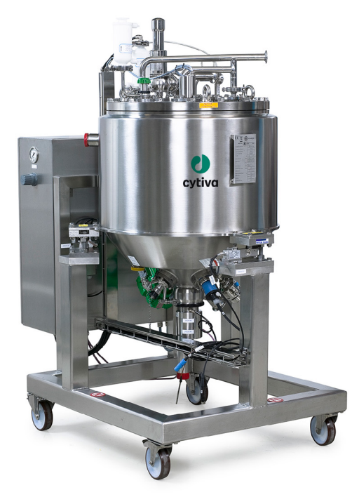
Fig 4. UniFlux 100 L tank.

Stainless steel tanks (surface finish Ra 0.5 \mu m ) are mounted on a skid with castors, allowing for easy movement for storage or for cleaning of floor space (Fig 4). The 5 and the 10 L tanks for the UniFlux 10 system are mounted on the system skid.